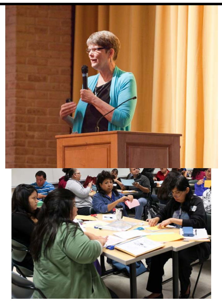
Teachers learning together