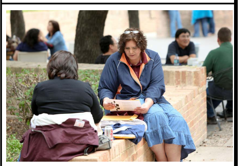
Teachers planning their day of staff development Over 90 sessions were offered throughout the day

The Rio Grande Valley Council of Teachers of Mathematics (RGVCTM) is dedicated to the advancement of mathematics education in South Texas. This annual conference is the largest conference of its kind in the state of Texas. In partnership with the University of Texas – Pan American, it provides the opportunity for Valley teachers to receivemeaningful mathematics professional development close to home. We invite you to join us for this outstanding event.